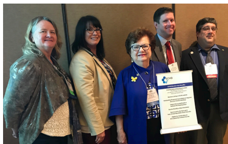
SCHB at NERM 2019