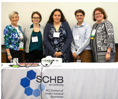
“Stories from the Front” Symposium at NORM 2019