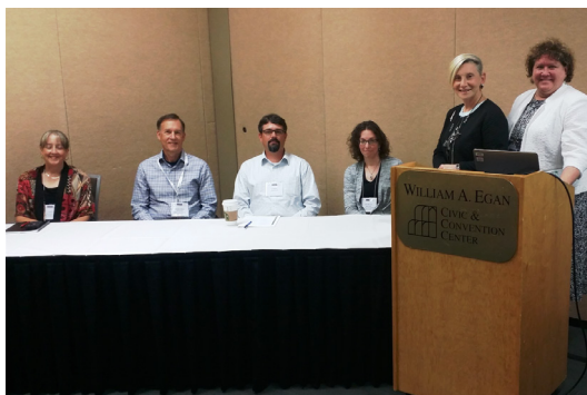
SCHB/PROF NETWORKING LUNCHEON