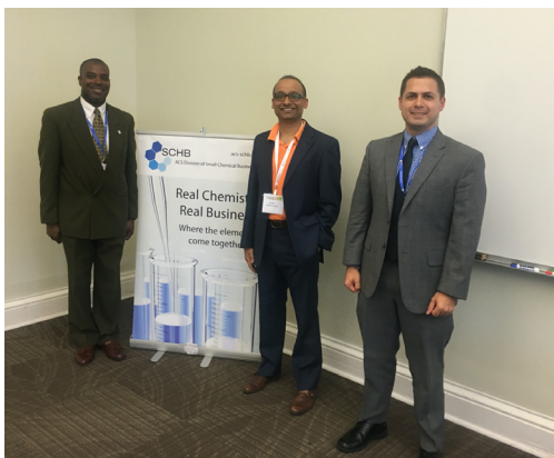
SCHB MARM SESSION