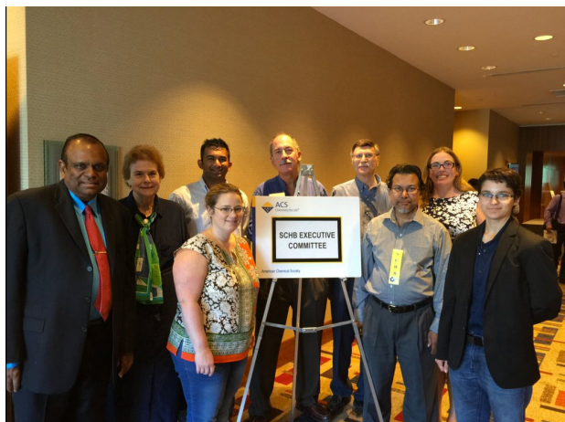
SCHB Executive Committee